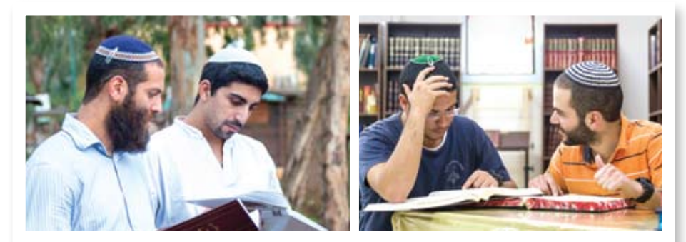
Students in the Mechina's Teachers' Training Program

Tamir warmly congratulates its very first graduating class of new educators! As part of its intensive, four-year teachers' training program (and in collaboration with the Neve Sha'anan Teachers Training College in Haifa), a pioneering group of Tamir Mechina graduates have received a Bachelor's Degree in Education (B. Ed.). These star educators will be best-equipped to solve the core issues of low self-esteem and underachievement in their home communities by applying the very same skills and values they learned at the Mechina.